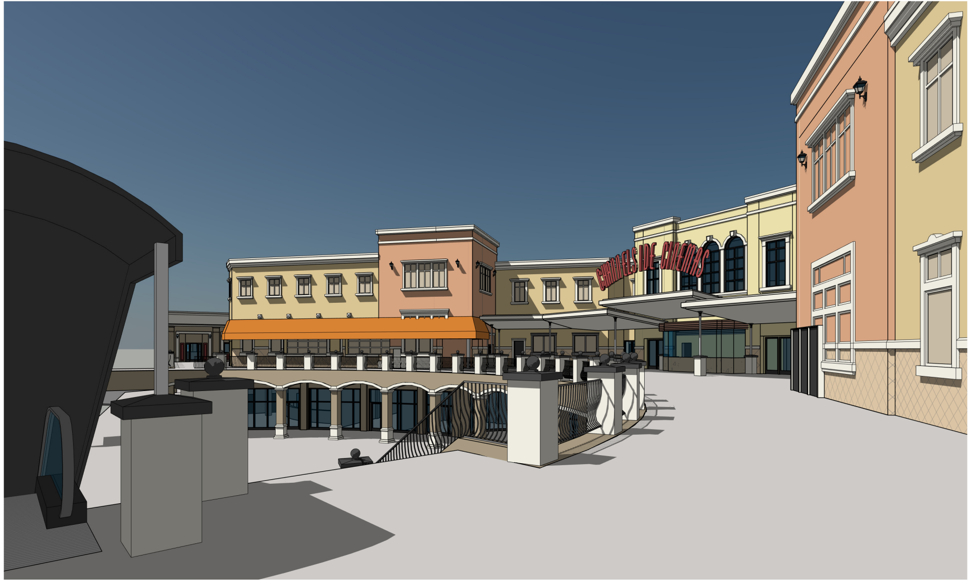
3 Courtyard View 2