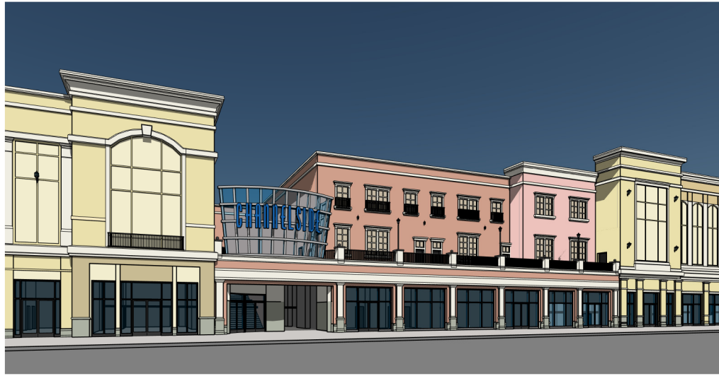
2 Street View