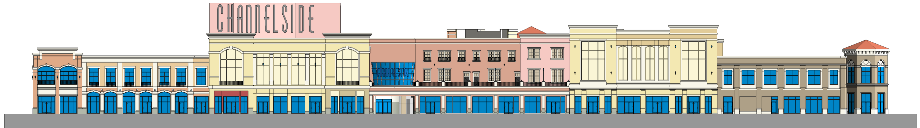
4 North Elevation 1" = 40'-0"