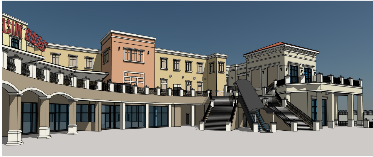
1 Courtyard View 1